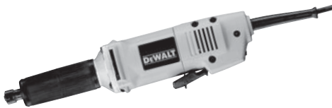
DW888 2" (50mm) Die Grinder