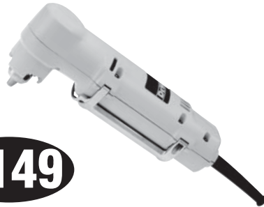
DW160V 3/8" (10mm) VSR Right Angle Drill