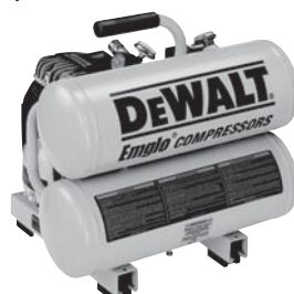
D55151 1.1 HP Continuous 4 Gallon Electric Hand Carry Compressor