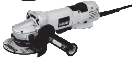
D28144 6" High Performance Cut-Off/Grinder w/ No Lock-On Paddle Switch