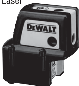
DW084K Self Leveling Level, Plumb, & Square, 4 Beam Laser