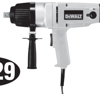
DW297 3/4" (19mm) Impact Wrench