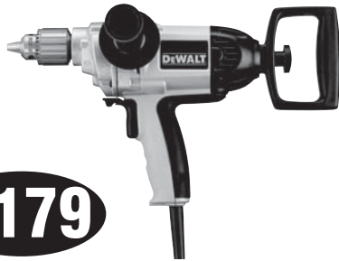
DW130V 1/2" (13mm) Spade Handle Drill