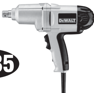
DW294 3/4" (19mm) Impact Wrench with Detent Pin Anvil