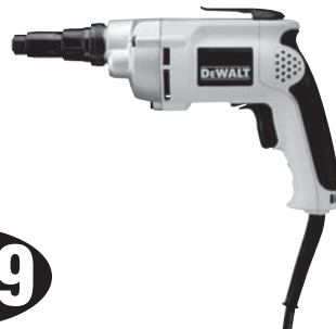
DW268 2,500 rpm VSR VERSA-CLUTCH™ Scrugun