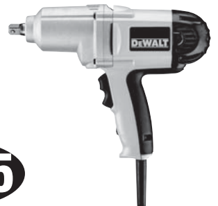
DW292 1/2" (13mm) Impact Wrench with Detent Pin Anvil