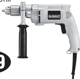
DW235G 1/2" VSR Drill