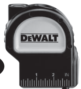
DW082K Laser Plumb Bob