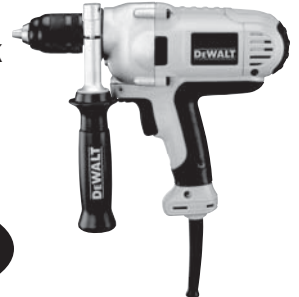
DWD215G 1/2" (13mm) VSR Mid-Handle Grip Drill with Keyless Chuck